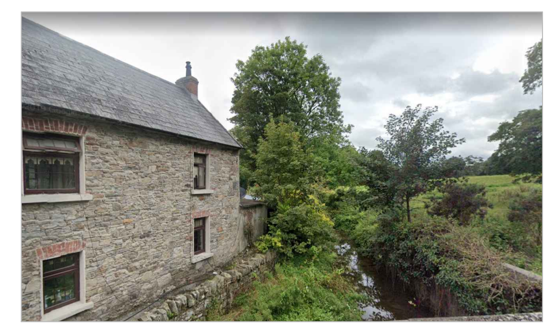
EXISTING PROPERTY BOUNDARY WITH WATERCOURSE