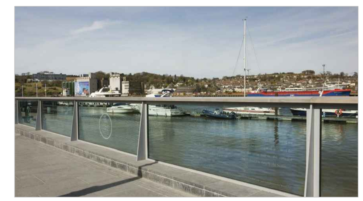
EXAMPLE OF GLASS FLOOD WALL IN WATERFORD CITY